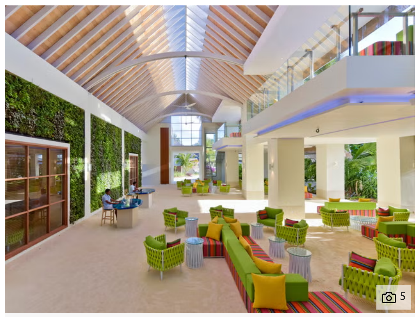
The bright colours of the reception set the vibe for the resort (Kandima)

Instantly recognisable as the Maldives, Kandima is characterised by white sand and pale blue ocean. But there's also lush vegetation, which gives the resort a jungle-like feel. If visiting during the rainy season, insect repellant is a must as the humidity means the mosquitos are out in full force. The bright and colourful design means the resort feels more inclusive and fun than other luxury and exclusive hotels in the Maldives. It also leans into the fact that it's meant to be a destination for fun activities.