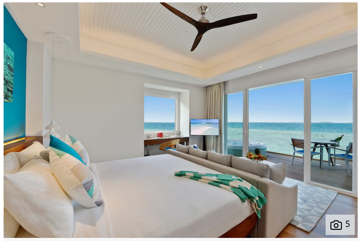
Kandima has 264 studios and villas to choose from (Kandima)