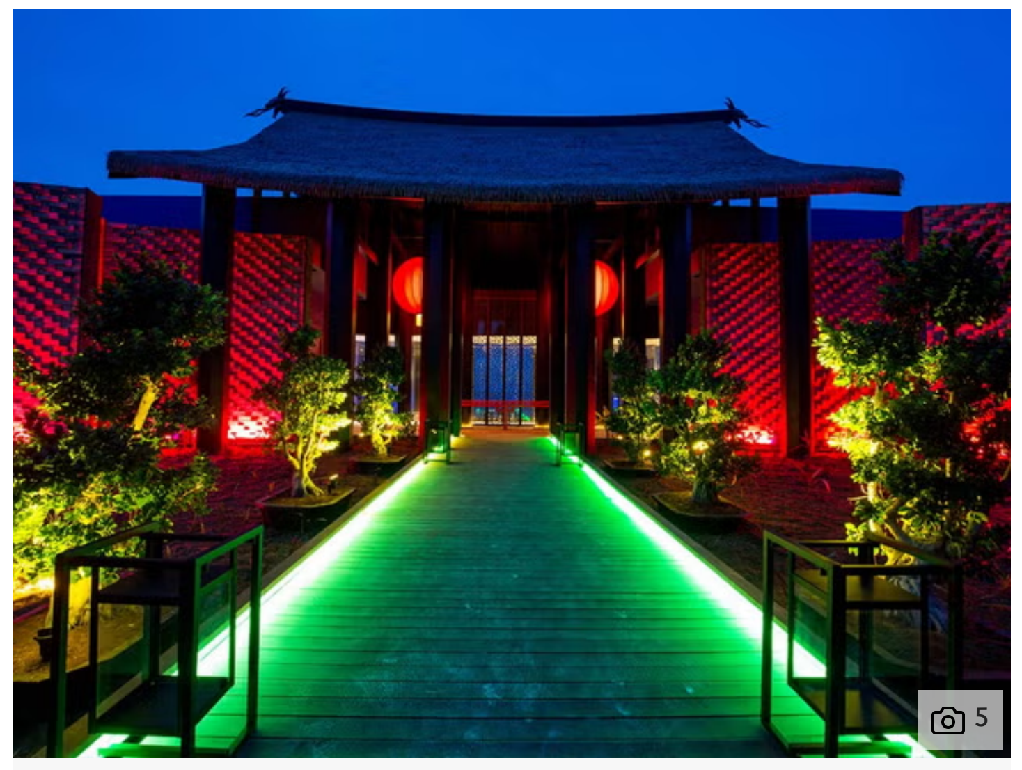
Sea Dragon's Asian-inspired menu was superb (Kandima)

Lunch is also a buffet service at Flavour during off-peak, and Zest is open in high season. The offering is extensive, with a large number of pre-cooked dishes. While I'd have liked a greater salad selection, if you've spotted something you enjoy at breakfast, the waiters are more than happy to serve it up at lunch too.