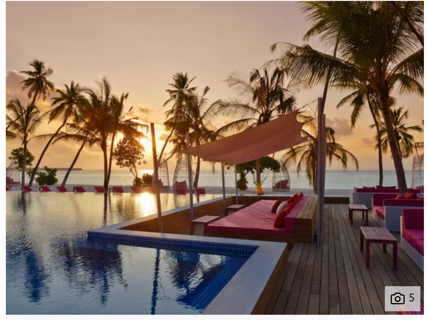
The pink-hued main pool area has its own bar (Kandima)

Kandima, Maldives hotel review: Relaxed, family-friendly beach resort backed by lush jungle | The Independent