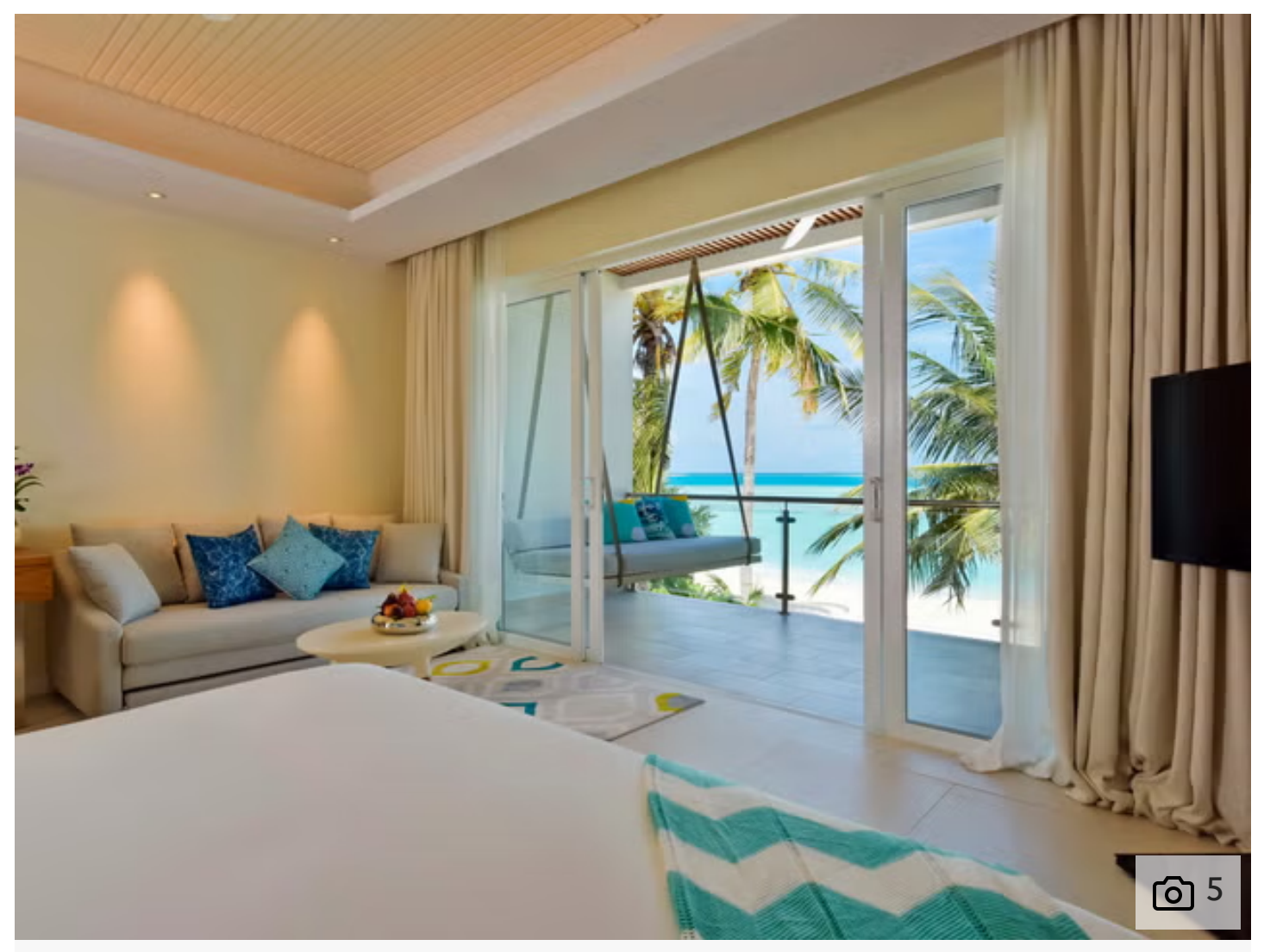
The sky villas are the most affordbale accommodation options (Kandima)

Ocean villas are located on a jetty, and are quiet and sophisticated, feeling miles away from the busy main bar and restaurant. A great choice for couples.