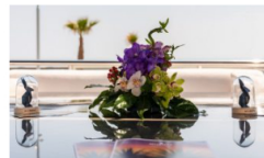
Sustainability Celebration: Mijenta & Althaus Yachts at Monaco Yacht Show