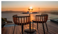
Serene Adult-Only Getaways: Kivotos Santorini and Jamaica