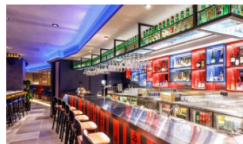
ANJU Restaurant & Bar: Exciting Debut at Elements Mall