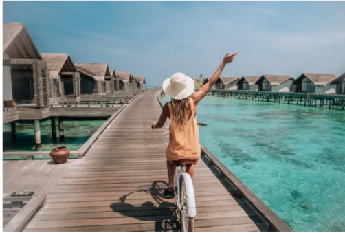
Tropical vacations young woman with bicycle on wooden pier in the Maldives contemplating overwater villas on the Island. Getty Images Image used for illustrative purpose. Getty Images