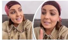
Amy Dowden admits having 'meltdowns' over hair loss amid cancer battle