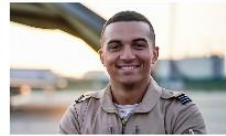
Sensors on the bleep? Don't panic, jet pilot Buzz is light years ahead