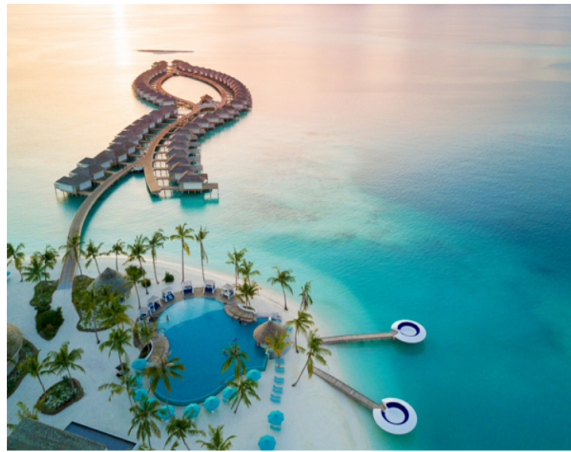
Kandima Maldives_Aerial shot