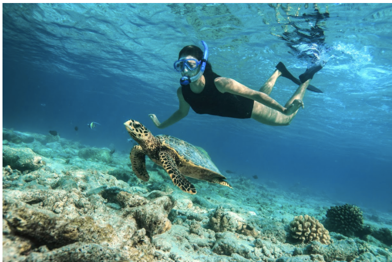
Featured Image: Baros Maldives

Experience an egg hunt like never before this Easter in Maldives! Baros Maldives is hosting an underwater Easter treasure hunt in the turquoise lagoon. Snorkel in the shallow waters hunting for the hidden surprises.