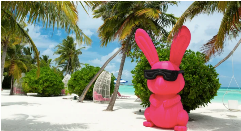
Featured Image: Kandima Maldives

All the little bunnies visiting Kandima this Easter will enjoy all the egg-citing activities planned at the Kandiland, the island's Kid's Club. The three-day program from April 6-9, 2023, includes Easter egg decorating, bunny crafts, festive cookie decorating and an Easter egg piñata. Little artists will love the special string art workshop to learn the technique to create a colorful manual or sea-inspired artwork. The little ones will be thoroughly entertained with all the festive activities this Easter holiday in Maldives.